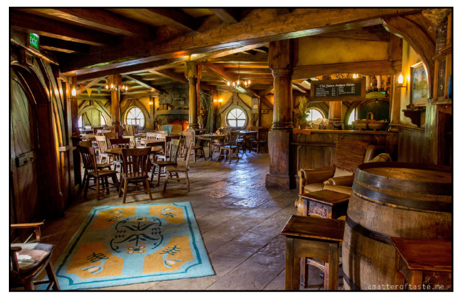
Image 6. The Green Dragon Inn, New Zeland b (The Green Dragon Inn - Hobbiton Movie Set Tours, 2019)