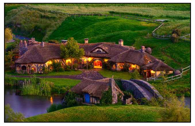
Image 5. The Green Dragon Inn, New Zeland a (The Green Dragon Inn - Hobbiton Movie Set Tours, 2019)

Fairy-tale, series and movie-themed concept restaurants reflect international fairy-tale, series or movies to their menus, services and interior designs. There are mostly fairy tale and movie-theme