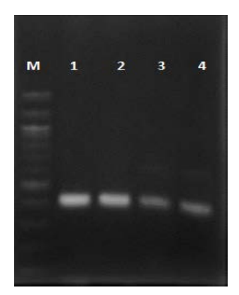
Figure 3. Amplification products of Meloidogyne arenaria with specific SCAR primer set Far/Rar (Line;1,2,3,4= 420 bp fragment; M: 100bp marker ladder).