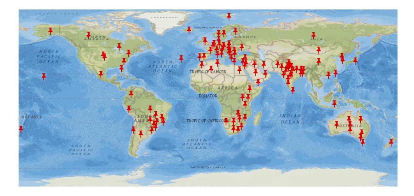
Figure 2 Distribution of the C. album in the current time over the entire planet (Heap, 2022)