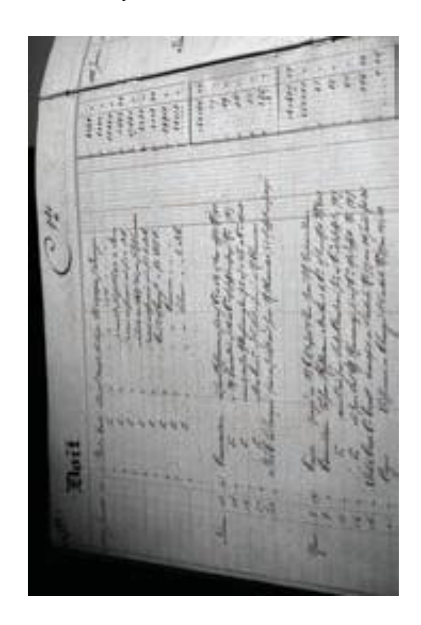
Annex 2: Imperial Ottoman Bank - Main Book - 1888