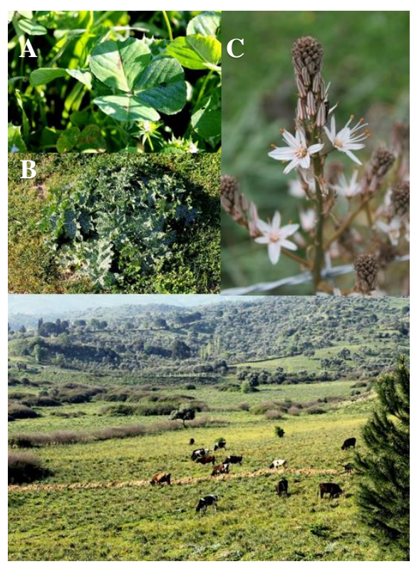
Figure 1. Çakmar rangelands (A: Medicago arabica ; B: Silybum marianum ; C: Asphodelus sp.)

The analysis of biodiversity in rangeland studies often involves the assessment of various factors such as species richness, ecosystem services, and livestock production. emphasized the importance of landscape-scale features and practices, such as hedgerows, in enhancing biodiversity and ecosystem services in agroforestry systems (Torralba et al., 2016). Similarly, utilized a model to assess the impact of livestock production on rangeland biodiversity, highlighting the significance of understanding the effects of food demand and livestock production on future biodiversity (Alkemade et al., 2012).