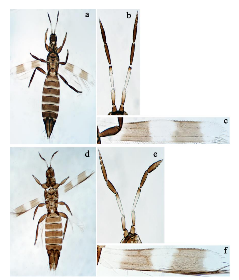
Figure 1. Aeolothrips female species. A. collaris (a-c): (a) body, (b) antenna, (c) right wing. A. intermedius (d-f): (d) body, (e) antenna, (f) right wing.

21 days at a temperature of 14, 6 days at a temperature of 26, and 4 days at a temperature of 38 (Loomans et al. 1995).