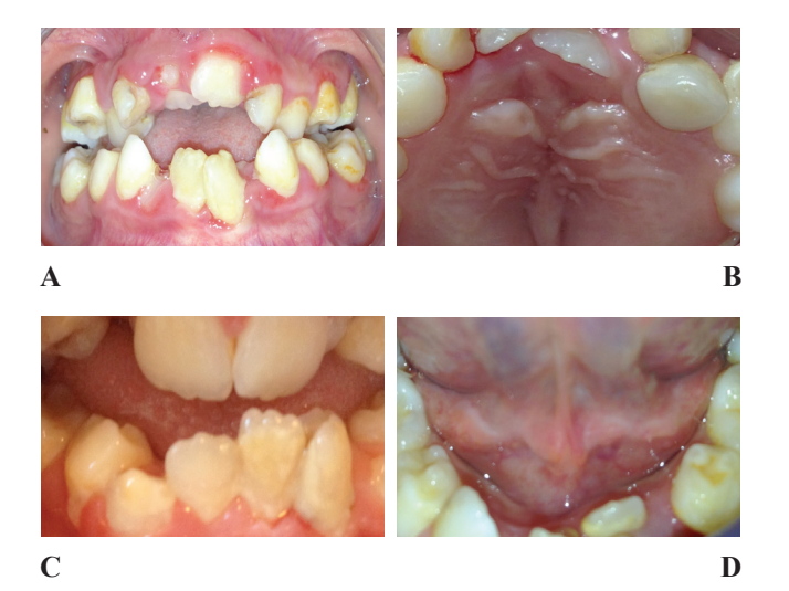
Figure 2 : Frontal (A) and palatinal (B) view of Case 2 at first appointment, frontal (C) and occlusal (D) view after 18 – month follow-up.

stature and presents facial asymmetry. The patient's main complaints were her facial appearance and tooth caries. Clinical examination of the patient presents short stature and retrognathic convex profile. Panoramic radiography showed maxillary left lateral incisor, all permanent second premolars and all third molars are congenitally absent. In intraoral examination, anterior cross-bite, grooved palate, delayed exfoliation of deciduous teeth, dental crowding, and caries observed (Figure 2A and 2B). Changes in gingival color and contour, edema, and very poor oral hygiene were present. These findings diagnosed as plaque-induced marginal gingivitis. The child brushed her own teeth once a day, without supervision from any adult. For a better oral hygiene the patient was given oral hygiene education. Restorative treatments of caries and treatment of marginal gingivitis are been completed. To provide the better oral hygiene protective treatments were made and recall visits occurred in every 3 months (Figure 2C and 2D).