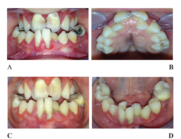
Figure 1 : Frontal (A) and palatinal (B) view of Case 1 at first appointment, frontal (C) and occlusal (D) view after 18 – month follow-up.

A 16 year old female patient, short stature, diagnosed with PKND at the age of 4, based on clinical features, including beaked nose and micrognatia. Extra-oral examination presents dystrophic fingernails, a slightly retrognathic, convex profile and mid-facial hypoplasia with proptosed eves. According to the panoramic radiograph the maxillary right first premolar, mandibular left and right second premolars and all third molars were congenitally absent. Both the maxilla and mandible were hypoplastic. and the mandibular angle was obtuse with prognathism. Intraoral examination revealed occlusal alterations, narrow and grooved palate, dental crowding, posterior cross bite and caries (Figure 1A and 1B). The periodontal examination of the patient composed of poor oral hygiene, visible plaque accumulation and gingival bleeding. Taking into consideration the fragility in these patients, appropriate restorative treatments and protective applications like fluoride or fissure sealant application were preferred. Patient was given oral hygiene education and recall visits occurred in every 3 months during the 18-month follow-up period (Figure 1C and 1D).