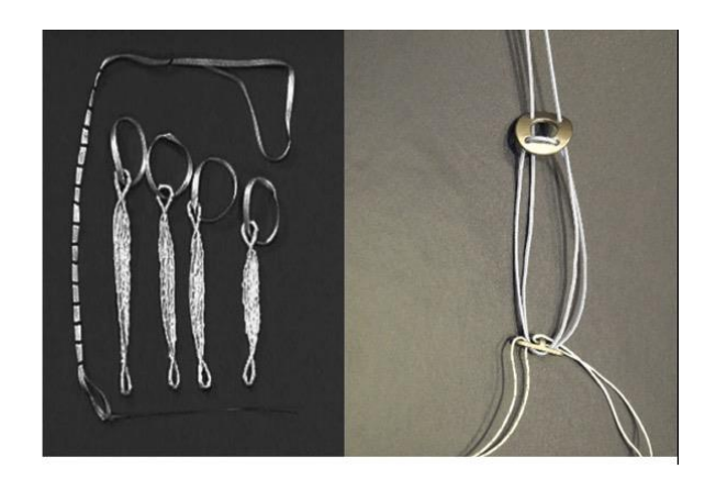
Figure 1. Synthetic bounds. LockDown® on the left and Tight-rope® on the right side.

For the operative technique, incision was done through the acromioclavicular joint longitudinal incision. With this incision, both the acromioclavicular joint and coracoid process can be reached. Synthetic bounds was carried out between coracoid process and distal clavicula. For LockDown® distal clavicular fixation carried out with screw and coracoid with loop system. For Tight-rope®, both distal clavicular and coracoid fixation carried out with endobutton (Figure 1). Then, reduction was controlled with fluoroscopy. Acromioclavicular ligament and primer fascia on clavicle were repaired (Figures 2,3).