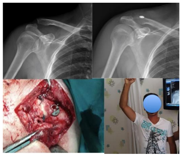
Figure 2. (clockwise): preoperative and post operative images of acromioclavicular dislocation treated with the Tight-rope® system. Intraoperative image of the system and repair of the acromioclavicular joint capsule. Final clinical result of the patient.