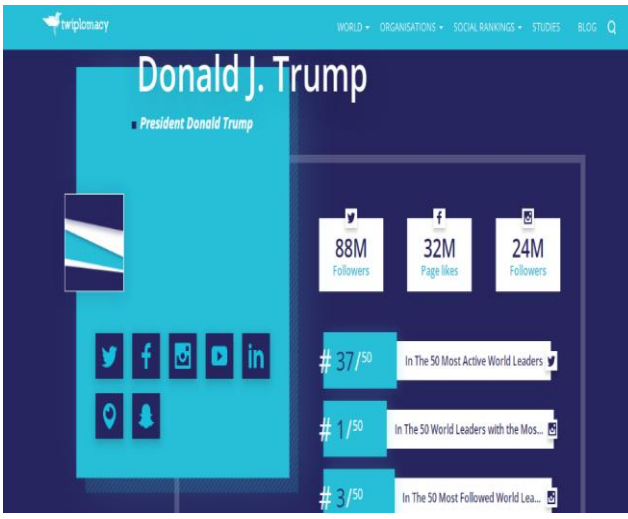
Figure 2. Donald Trump Twitter Account

Each of Trump's tweets reviewed contains negative statements, and such statements ignore the minimum language of courtesy and diplomatic respect required by the field of public diplomacy.