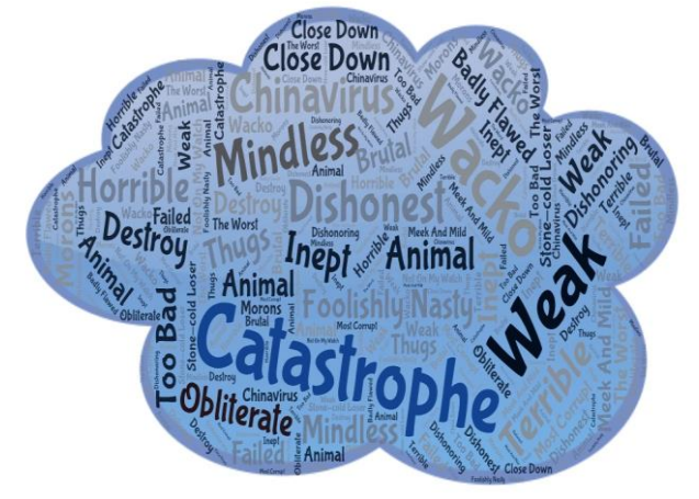
Figure 1. Negative Statements Mentioned in Trump's Tweets

In all of the tweets examined, Trump's statements, which are extremely negative in the context of public diplomacy, were found. A total of 30 negative statements were found in the content of the 13 tweets examined. The negative statements in question can be seen in the following word cloud: