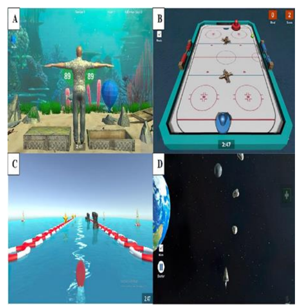
Figure 3. Serious Games